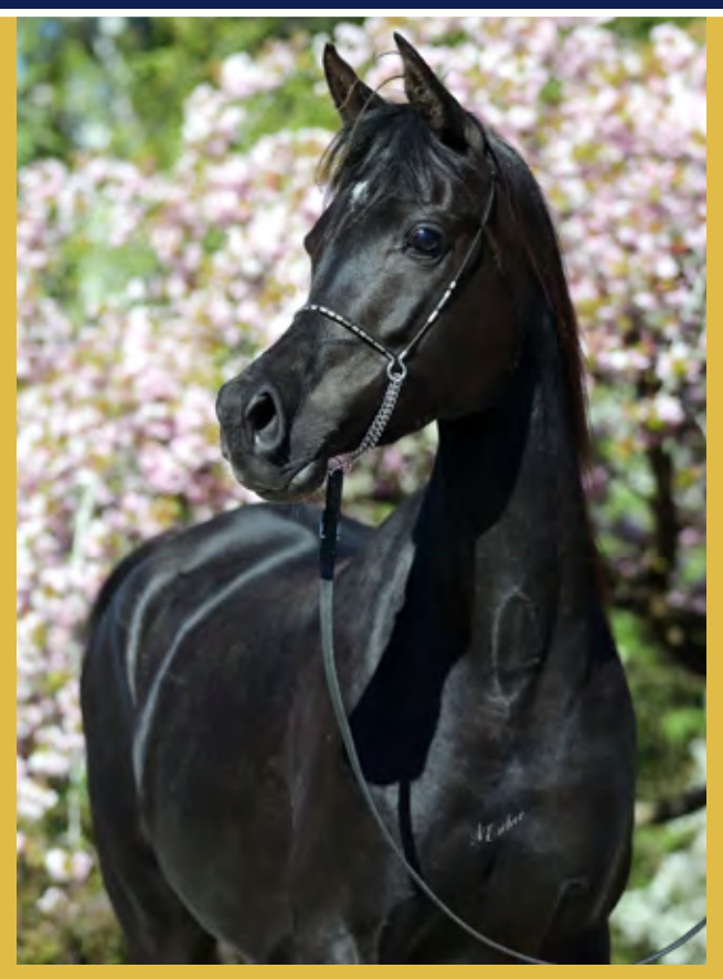
GR Aya Malikah (GR Faleeh x GR Aya Mahiba by Maheeb) goes back to Ansata Aya Maria, Bukra line