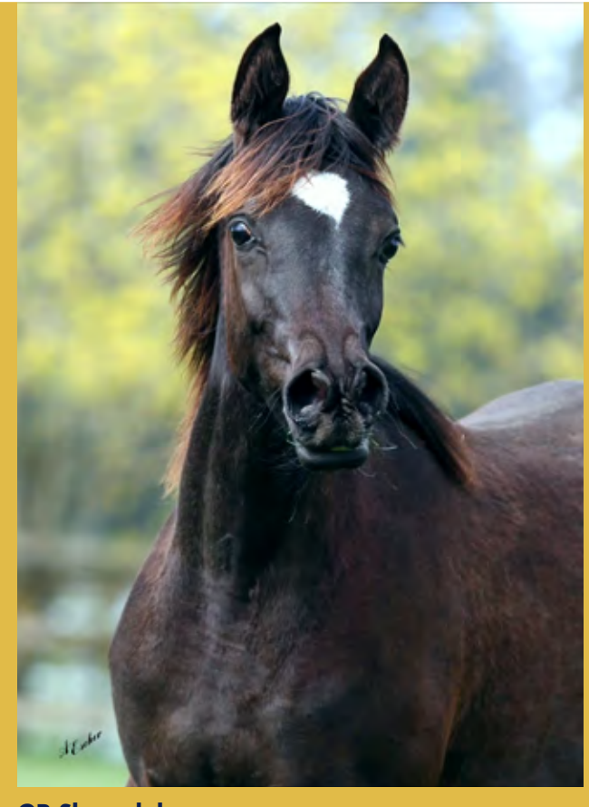
GR Shasadah black mare 2018 (black gold premium stallion GR Nashad x GR Shatigah by Pasha Farid) - goes back to Dalima Shah, in foal to GR Fasin

AE: Over the years we often showed our horses and many of our foundation horses and their offspring got Multi-Champions and gold premium stallions. For example Dalima Shah and her daughter Shadwanah (by Classic Shadwan) as well as Halims Asmara and her son GR Amaretto (by Classic Sahdwan) won among other titles the champion titles at the Egyptian Event Europe. Also our first homebred black mares GR