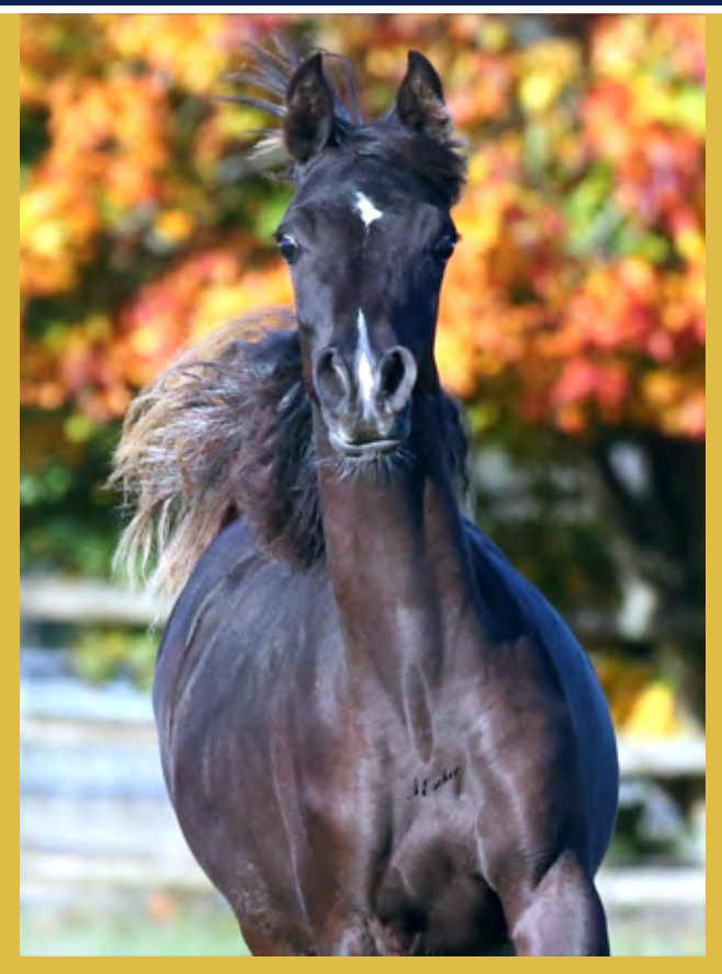
GR Mahidah black filly 2022 (GR Ishad x GR Maheeba) - Moniet El Nefous line - the future