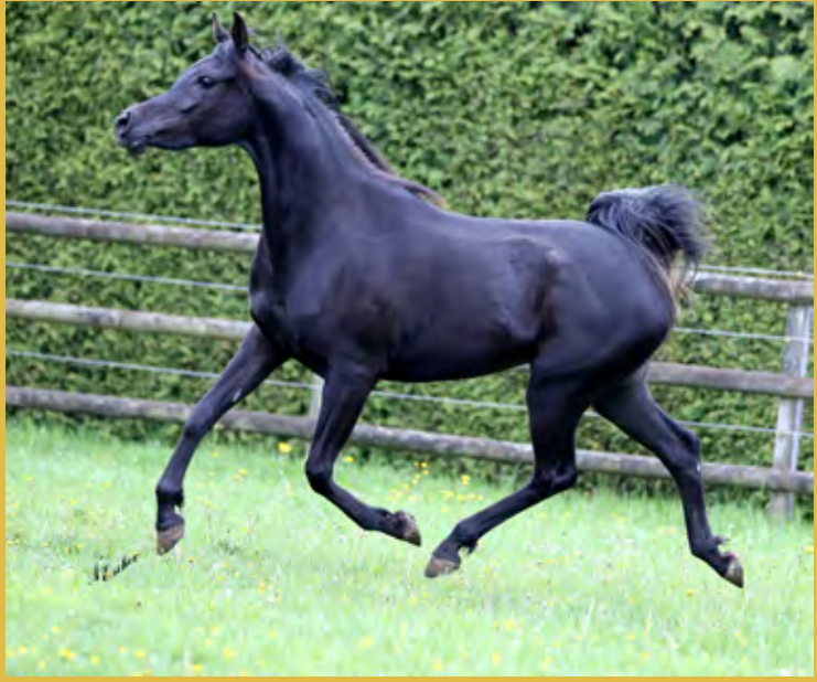
GR Samantha black filly 2019 (Maheeb x GR Safiniya by GR Faleeh) goes back to our first SE mare Samara (by Ibn Moheba)