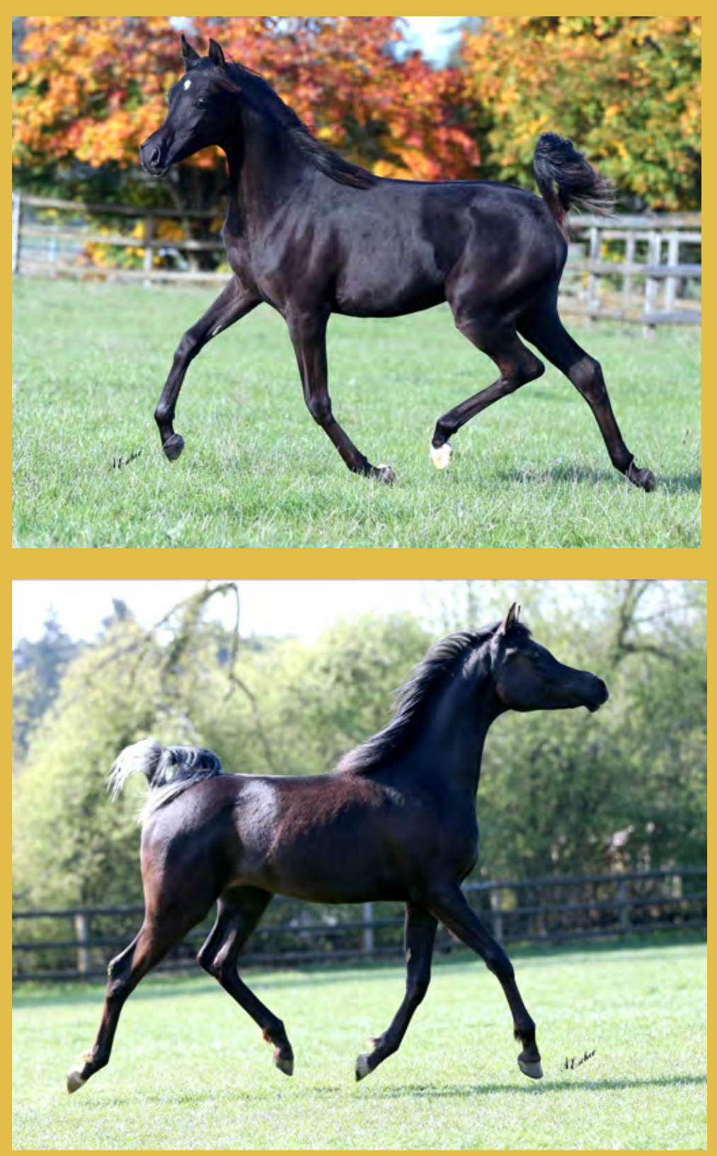
GR Fayadah 2022 (GR Ishad x GR Farasha, Maheeb x Fasinah) - the future

GR Larissa (GR Ishad x GR Layla) Abayyan line - the future