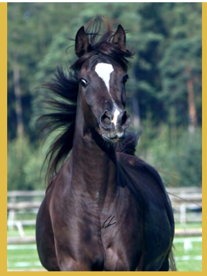
GR Shatigah black mare 2003 (Pasha Farid x Shadwanah) - last daughter of Shadwanah at stud, goes back to Dalima Shah

I have some great black mares and fillies from this line! We always used the Straight Egyptian bloodlines we liked personally not looking for trends and what other breeders prefer ... we went our own way for our own taste and what we loved ourselves!