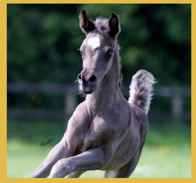
GR Shakadah black filly 2019 (GR Ishad x GR Shakirah, Maheeb x GR Shatigah) - great great granddaughter of Dalima Shah