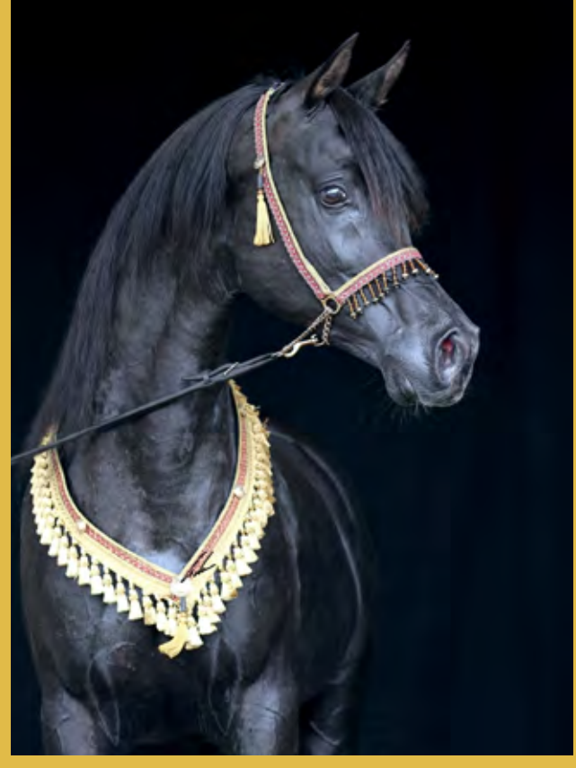
Maheeb (Classic Shadwan x Bint Bint Mahiba) - black gold premium stallion, sire of many of our breeding-horses

aim was that we both need to survive ...and we did! This year GR Bint Asmara gave birth to her first foal herself, the wonderful black filly GR Aseela by GR Ishad ... and this made me very happy!