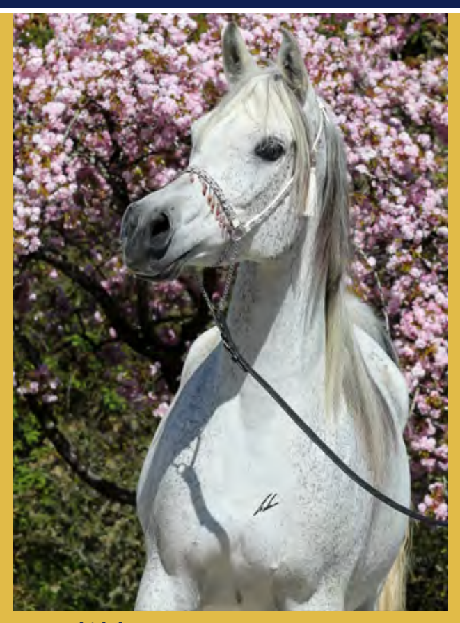
GR Nashidah (Classic Shadwan x Nejdshah) - mother of our homebred stallions GR Nashad (gold premium) and GR Lahab