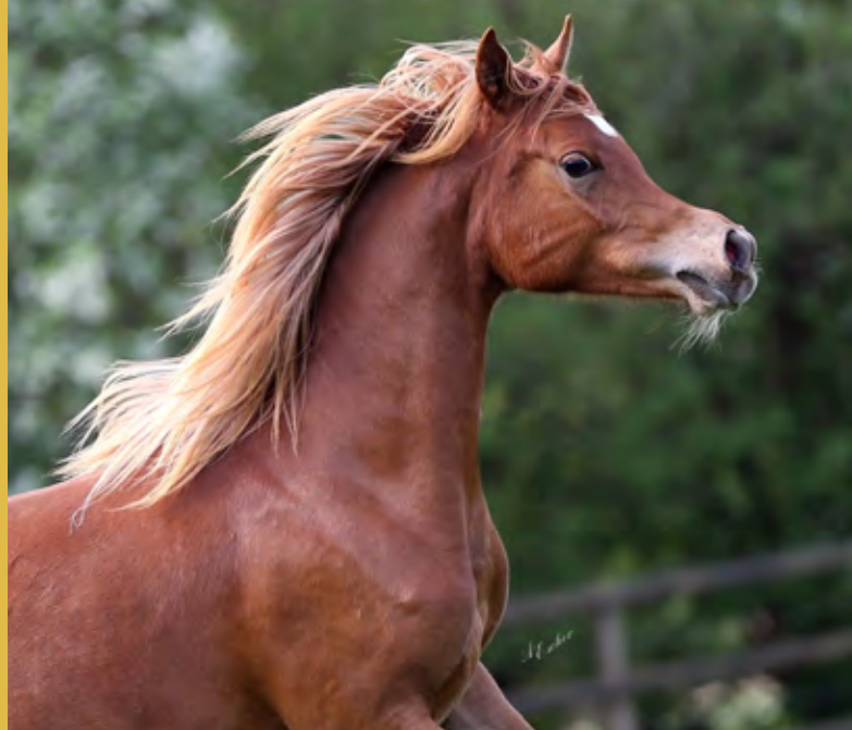
GR Alinah (GR Lahab x GR Anisha by GR Faleeh) great granddaughter of Halims Asmara - black producing