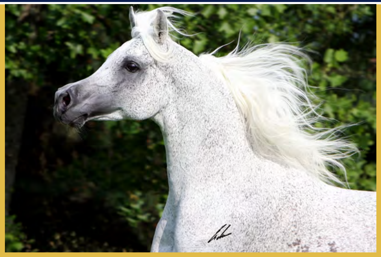
Classic Shadwan (Alidaar x Shagia Bint Shadwan) - Multi-Champion, foundation stallion