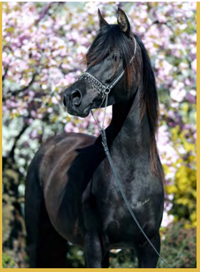
GR Layla (GR Faleeh x leasing-mare Sheherazade) - Abayyan line