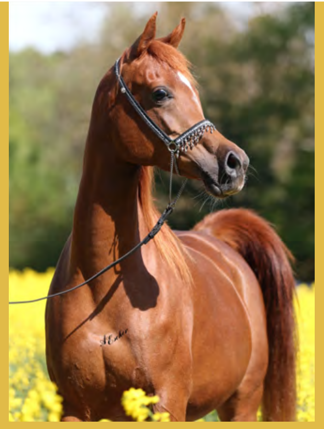
GR Anisha (GR Faleeh x GR Anastacia by Classic Shadwan)