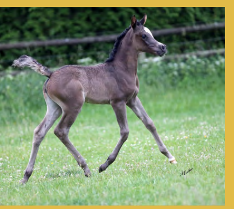
GR Adelle black filly 2022 (GR Ishad x GR Anastacia) - the future

Dalima Shah Multi Champion mare by Ansata Halim Shah - one of our foundation mares