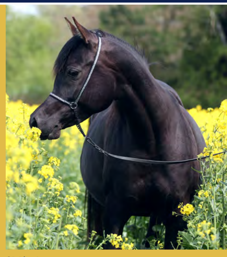
GR Bint Asmara (GR Moneef x GR Asmara) this year high pregnant goes back to Halims Asmara

GR Bint Asmara (GR Moneef x GR Asmara by GR Lahab) 13.9.16 - 4 months after Erwins death