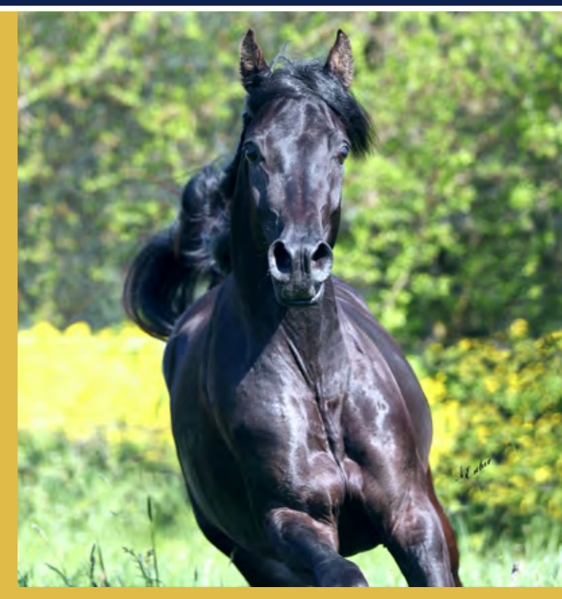
GR Fasin born 2019 (Maheeb x Fasinah by Nahaman) my youngest black gold premium stallion

loved the greys - in the end we love all colors so we only had a few blacks in the first years.