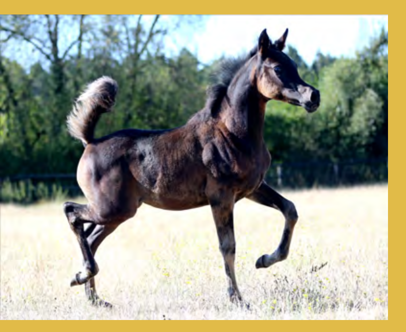
GR Nasirah black-bay filly *2022 (GR Fasin x GR Nashidah by Classic Shadwan) - GR Fasin's first foal