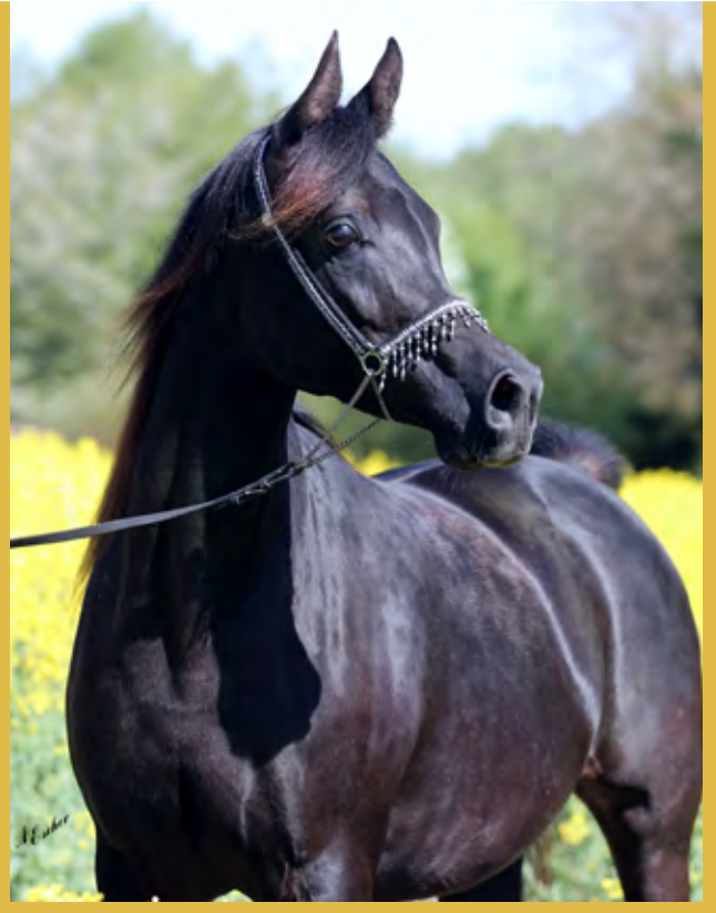
GR Farasha (Maheeb x Fasinah by Nahaman) - full-sister to GR Fasin