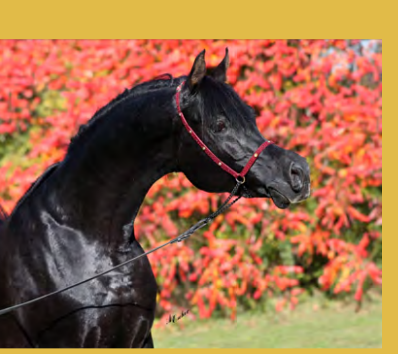
GR Moneef (GR Faleeh x GR Mona by Madallan-Madheen)

UE: Straight Egyptian breeding is one of most difficult ones as you must use a very limited gene pool that creates some problems in avoiding inbreeding and breeding overall harmonius and typey horse. Limiting the Straight Egyptian breeding to black colour group only must be even more challenging. How do you find your way to keep breeding beautiful and correct horses with such a limited requirements? AE: Most of our foundation horses were not bred to get black which means they had a bigger gene-pool as if we would bought mostly blacks in the beginning ... there were only very few black and black producing lines at this time which already often were inbred. And over the years we always were open to use sometimes outside stallions doesn't matter the color like World Champion Al Lahab if we thought they would bring us something new in blood and look ... in my recent herd