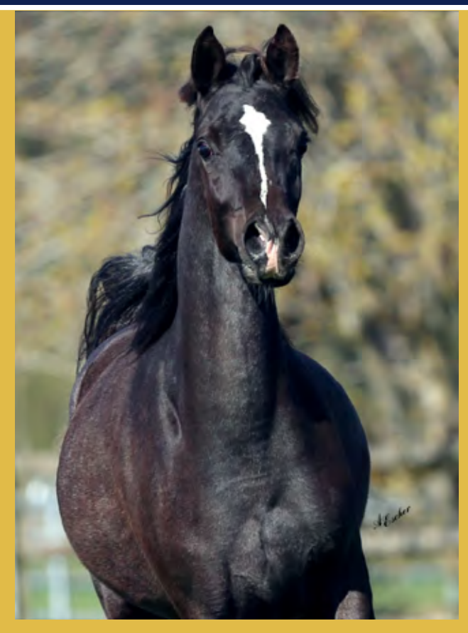
GR Dalimah (GR Mahal (GR Lahab x black Champion mare GR Marianah) x GR Danielle by GR Faleeh) goes back to Dalima Shah

very special black colt being born 1994 out of special bloodlines we quickly went to see him, and we bought him in age of 6 weeks! He was the very first foundation for our black breeding! Madallan-Madheen was not bred to get black, his parents were chestnut (Ansata El Salaam) and bay (the famous Madinah, mother of Imperial Madheen) but he got black "by accident" and was just bred to be a great horse ... and got a rare gold ribbon from the German registry later at the licensing show!